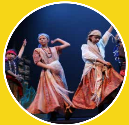
Broadway Jr. 2016

*Must be going into third grade and a secure reader